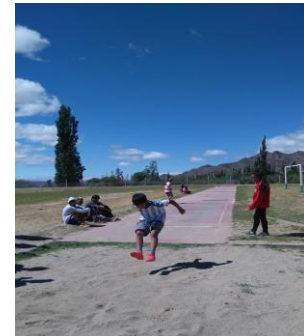
Some images from our recent athletics event